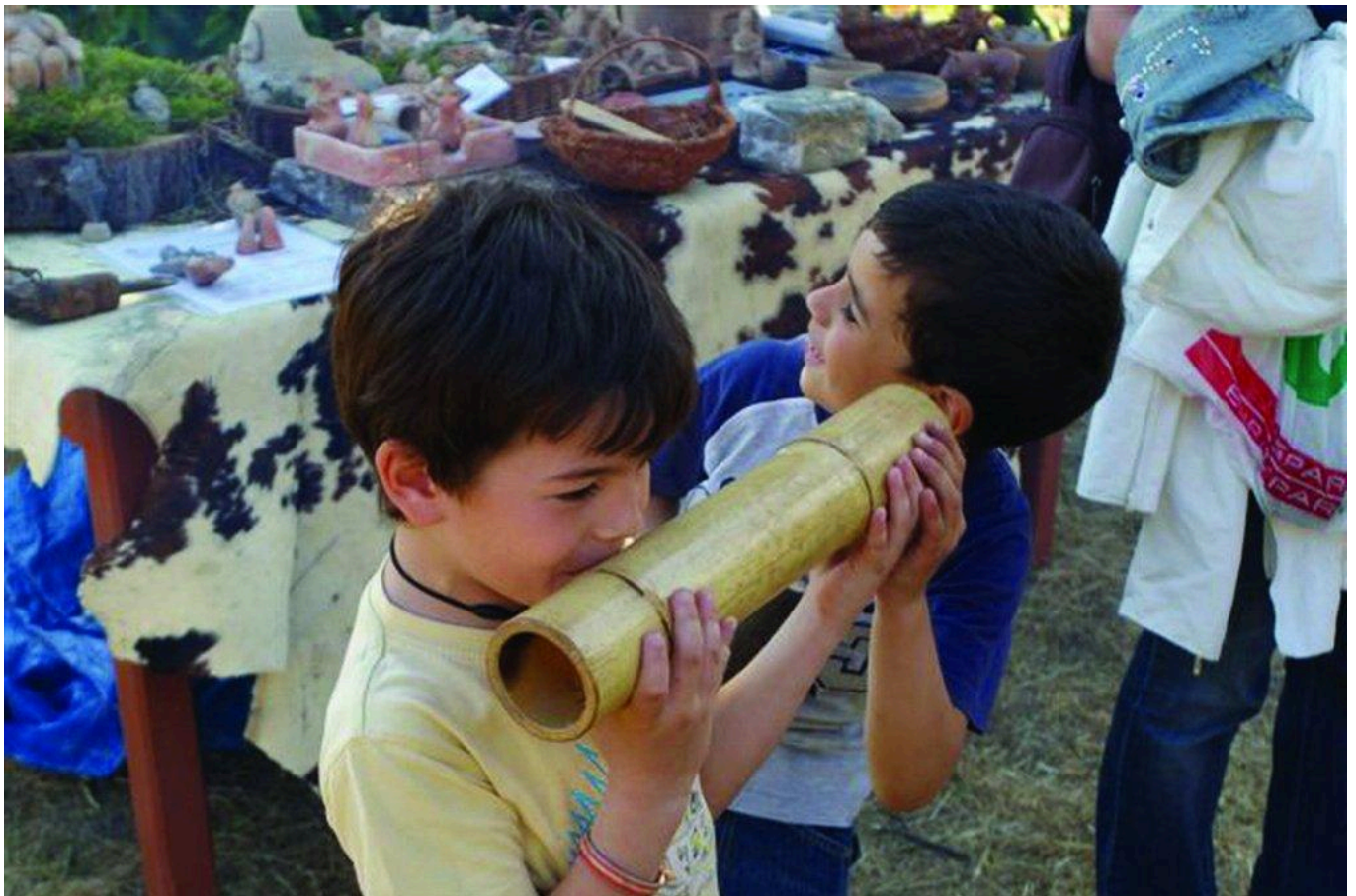
FIG 3. CHILDREN USING THE BAMBOO HORN.