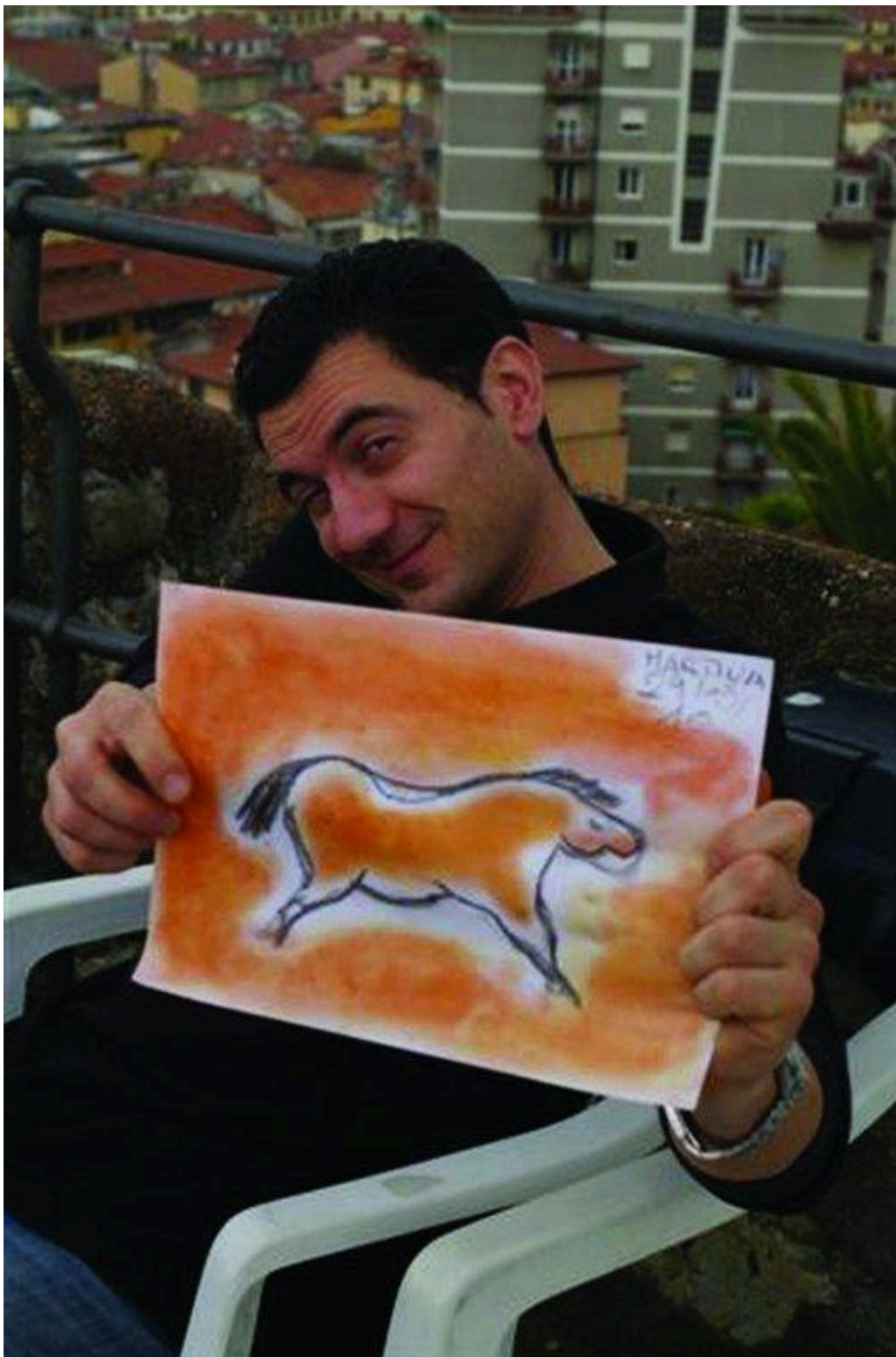
FIG 5. PARTICIPANT PROUDLY DISPLAYS A PAINTING IN CHARCOAL AND OCHER.