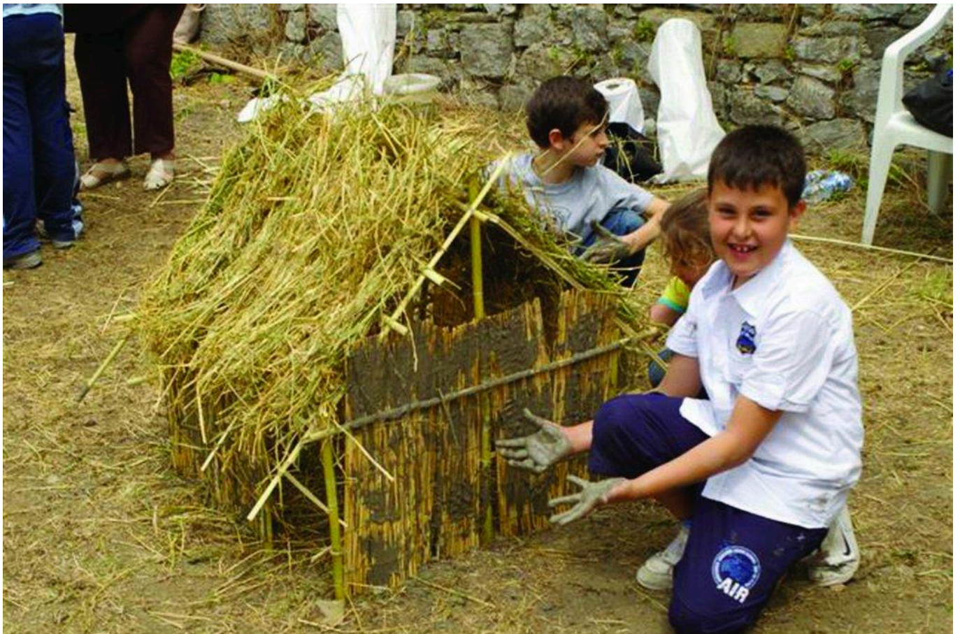
FIG 7. CONSTRUCTION OF A MODEL OF HUT MADE OF REEDS AND CLAY RAW.