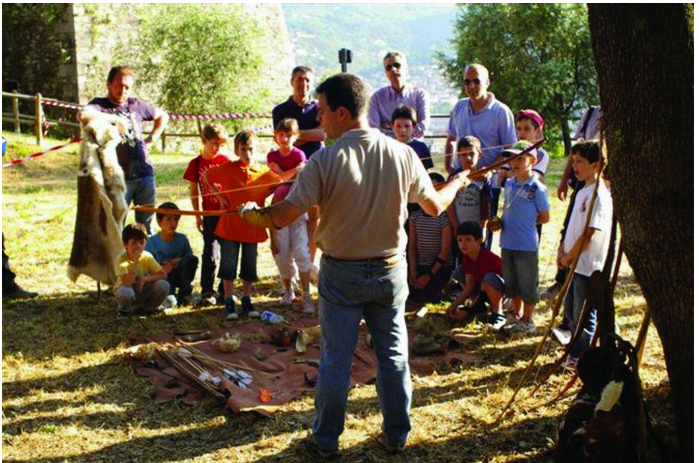
FIG 6. ARCHERY DISPLAY.