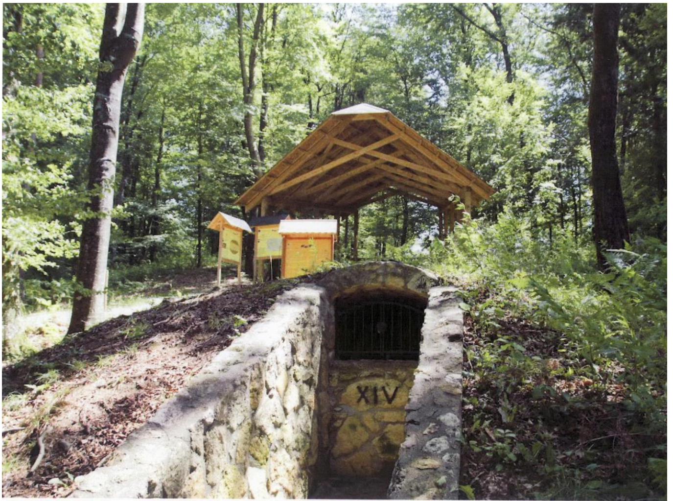
FIG 2. ARCHAEOLOGICAL PARK IN BRENGOVA.