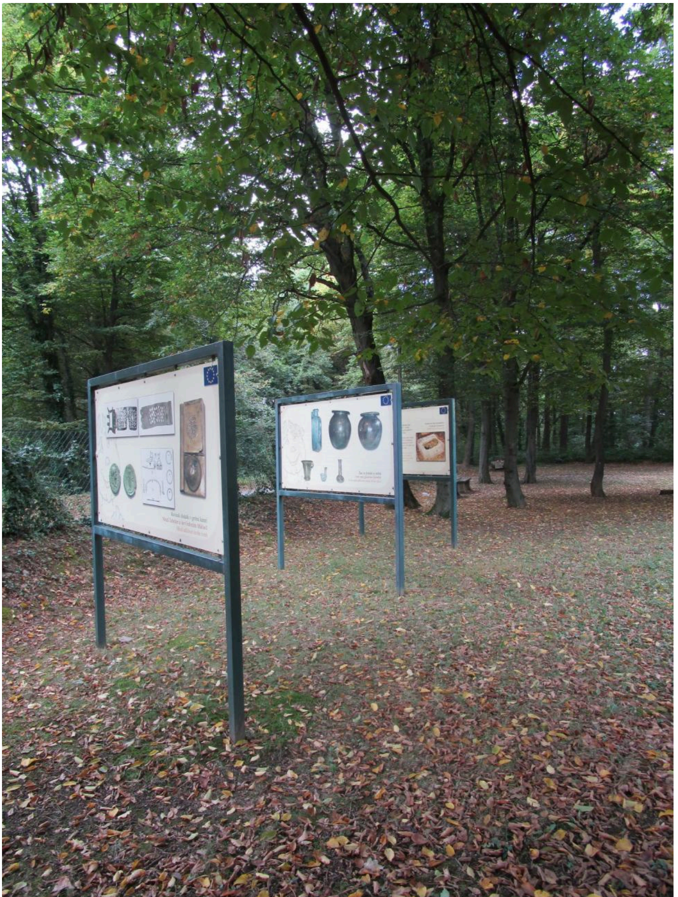
FIG 8. ROMAN TUMULI IN MIKLAVŽ NA DRAVSKEM POLJU.