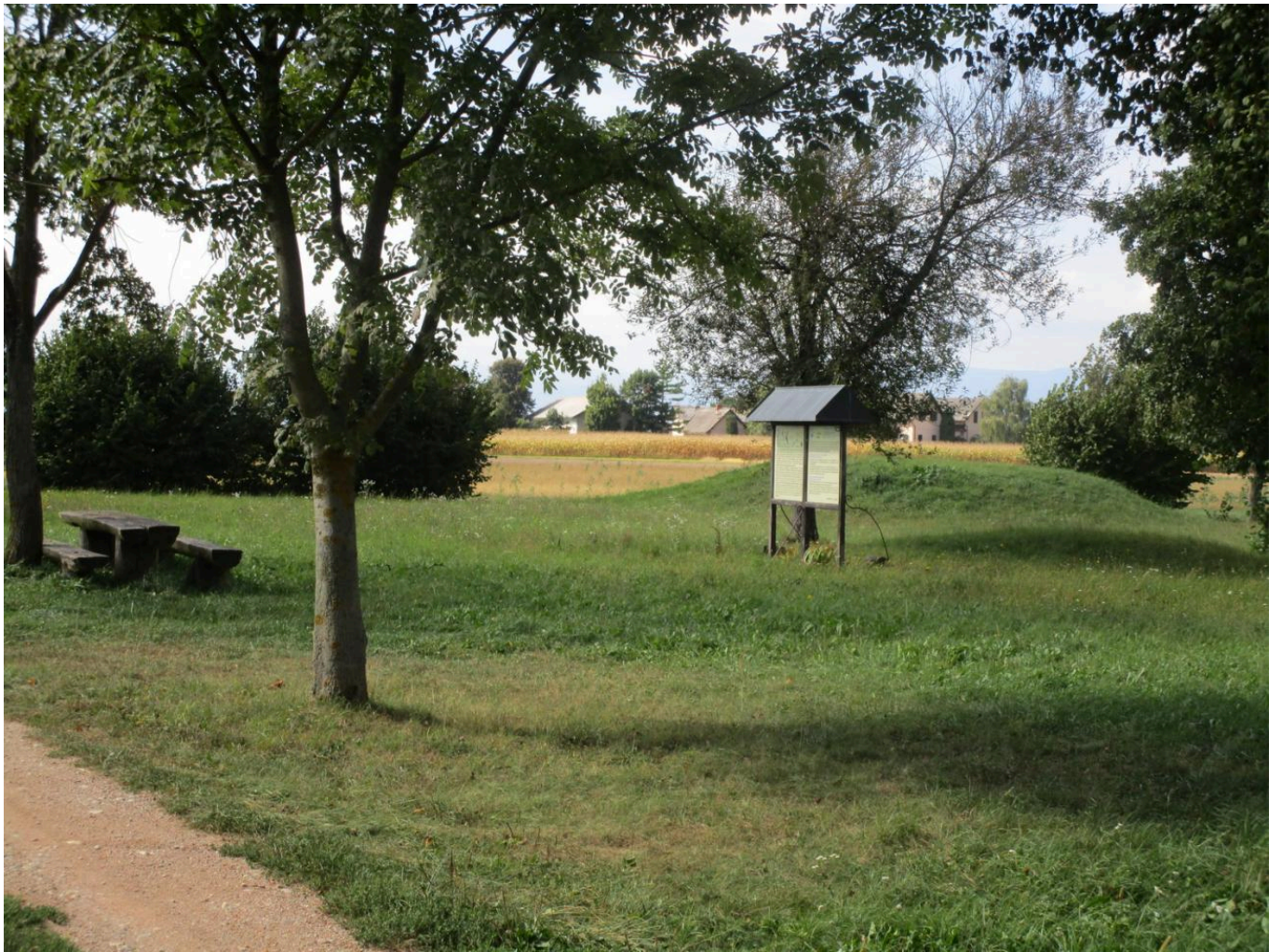
FIG 6. PREHISTORIC BURIAL MOUNDS IN PODLOŽE NEAR PTUJSKA GORA.