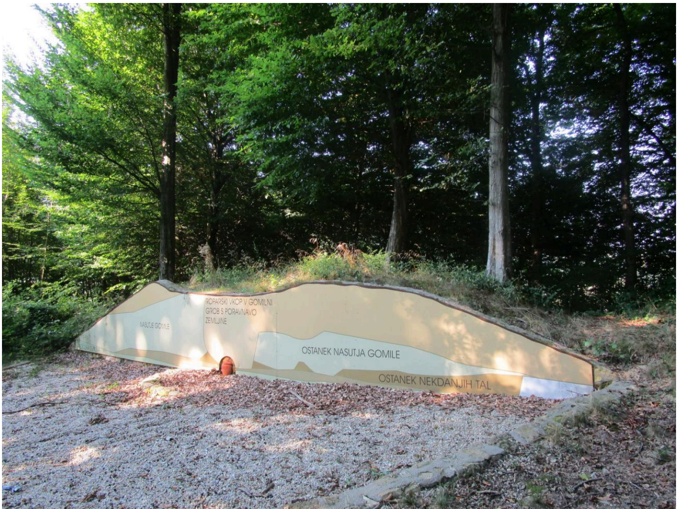
FIG 4. THE ARCHAEOLOGICAL ROUTE BENEDIKT- ARCHEOLOGICAL OPEN-AIR MONUMENT. PREHISTORIC AND ROMAN BURIAL GROUND IN BENEDIKT.