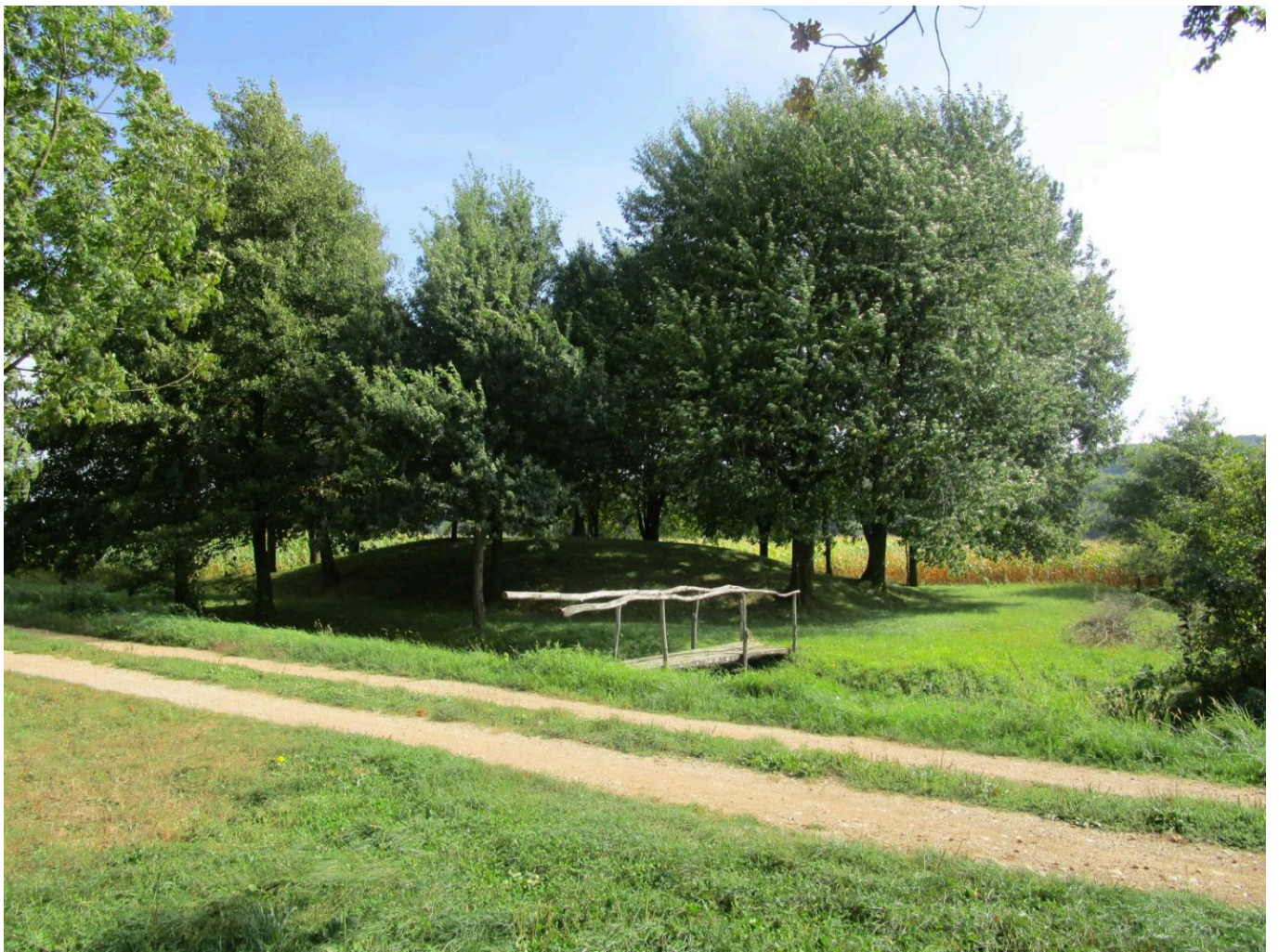
FIG 5. PREHISTORIC BURIAL MOUNDS IN PODLOŽE NEAR PTUJSKA GORA.