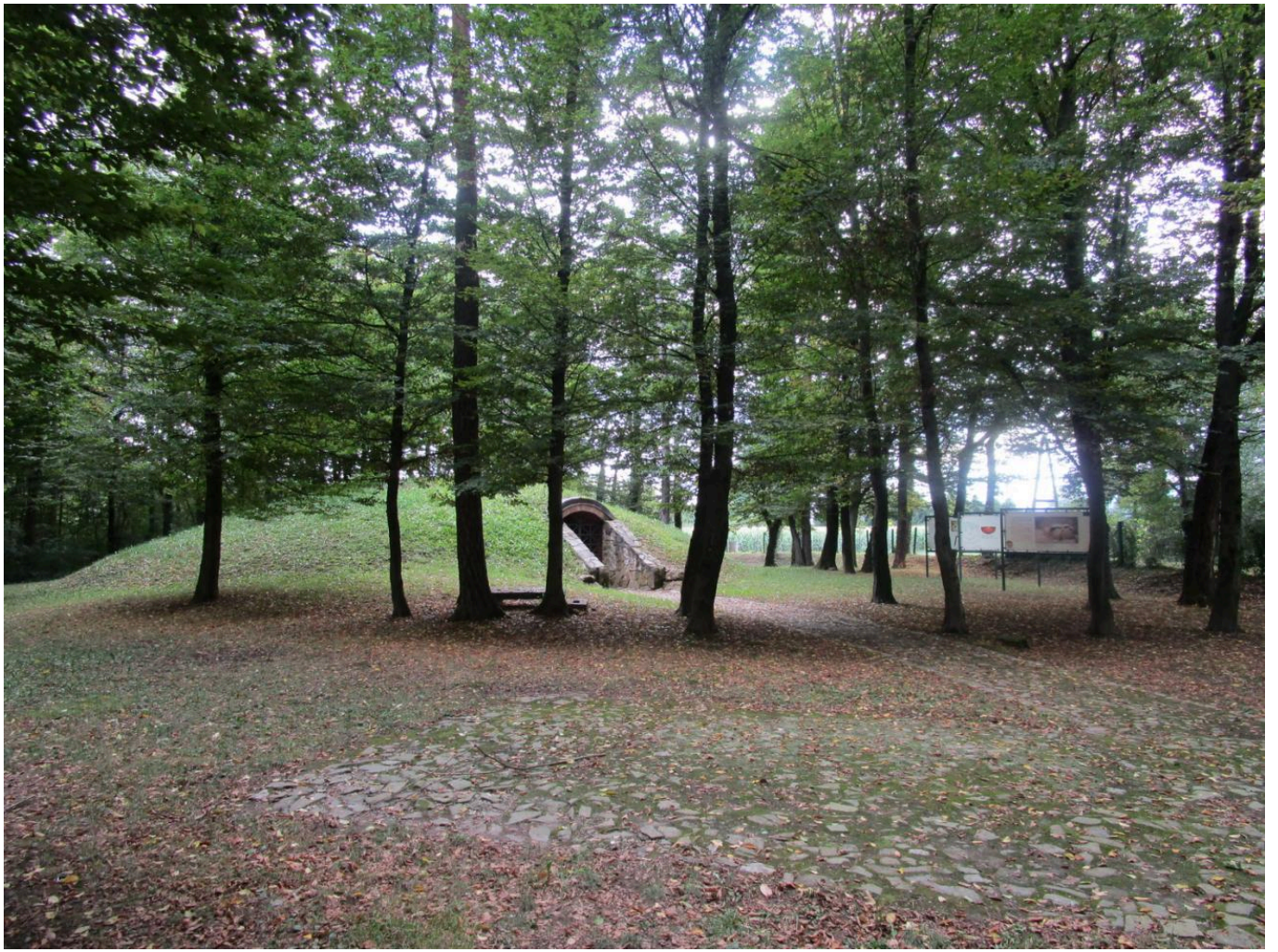
FIG 7. ROMAN TUMULI IN MIKLAVŽ NA DRAVSKEM POLJU.