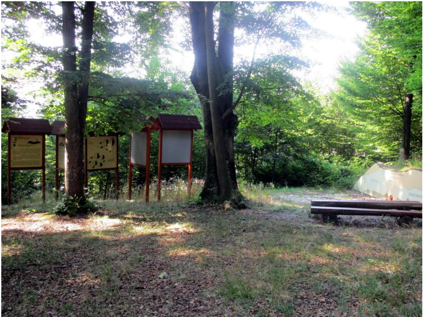
FIG 3. THE ARCHAEOLOGICAL ROUTE BENEDIKT- ARCHEOLOGICAL OPEN-AIR MONUMENT. PREHISTORIC AND ROMAN BURIAL GROUND IN BENEDIKT. PHOTO NATAŠA KOLAR.