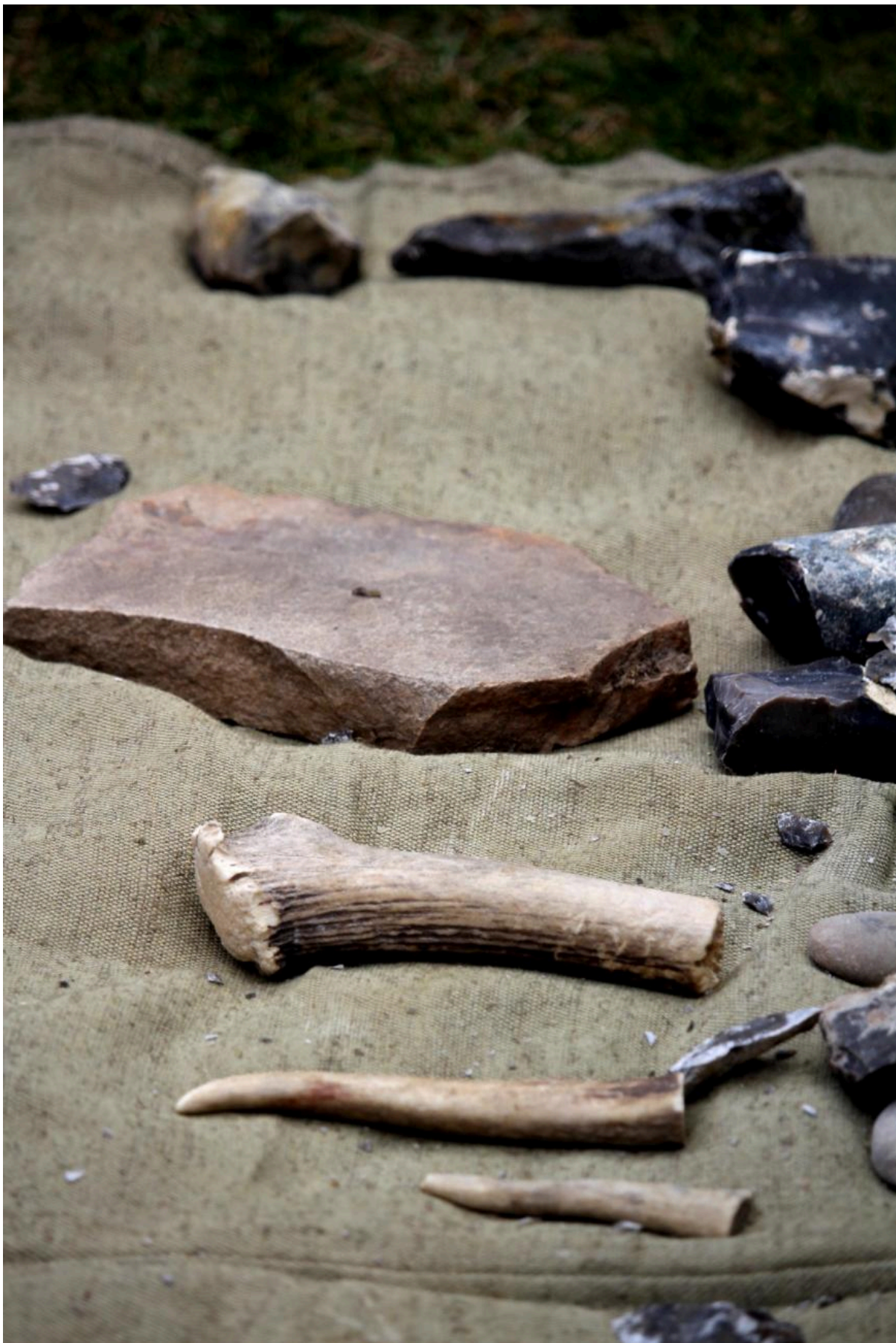
FIG 3. PRESENTATION OF FLINT SPLITTING TECHNIQUE PHD DMUTRO STUPAK, FRAGMENT.