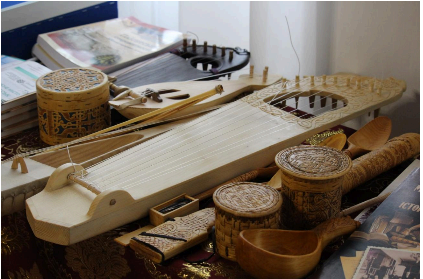
FIG 5. EXHIBITION OF MUSICAL INSTRUMENTS AND HOUSEHOLD ITEMS OF THE 12TH CENTURY. MASTER VOLODYMYR ILKIV.