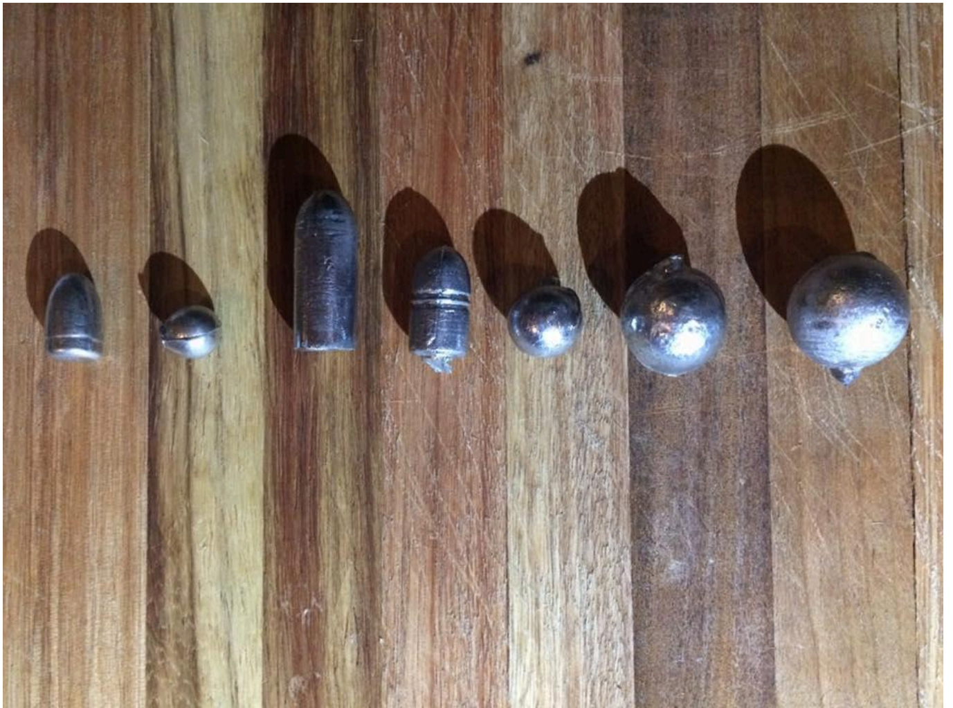
FIG 2. MUSKETS