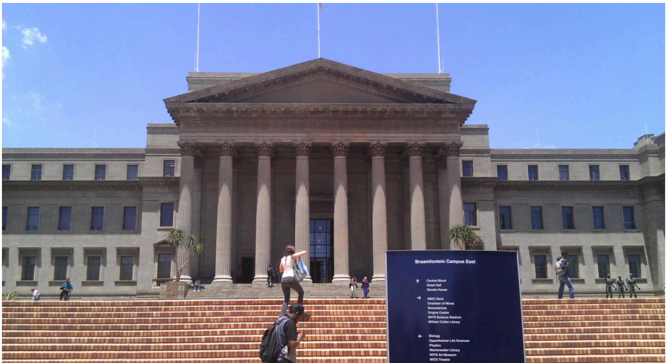
FIG 6. WITS GREAT HALL EAST CAMPUS