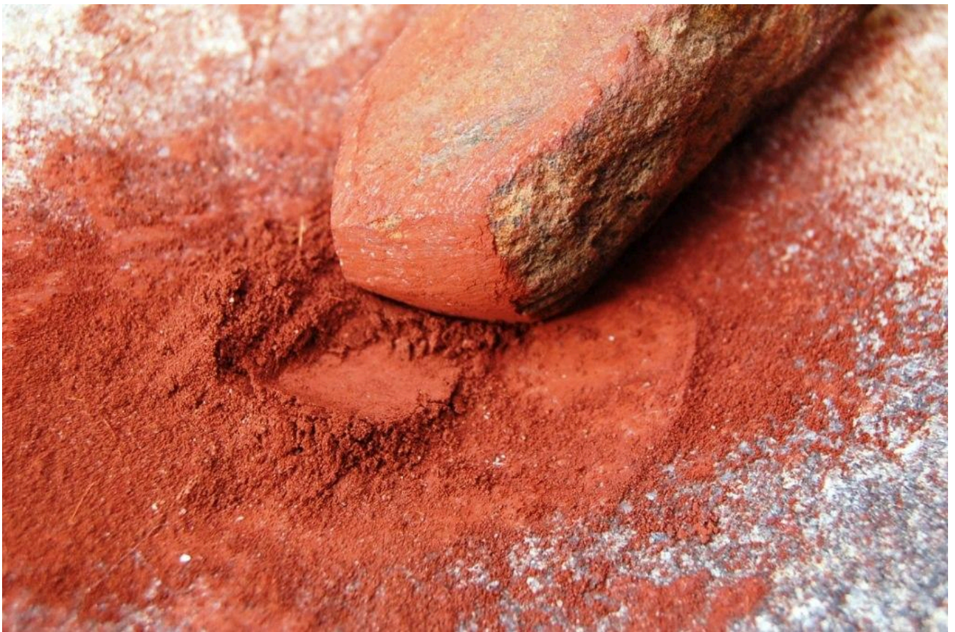
FIG 1. GRINDING OCHRE. PHOTO BY RIFKIN