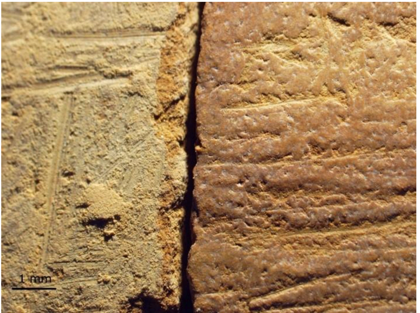
FIG 3. OCHRE USE TRACES.