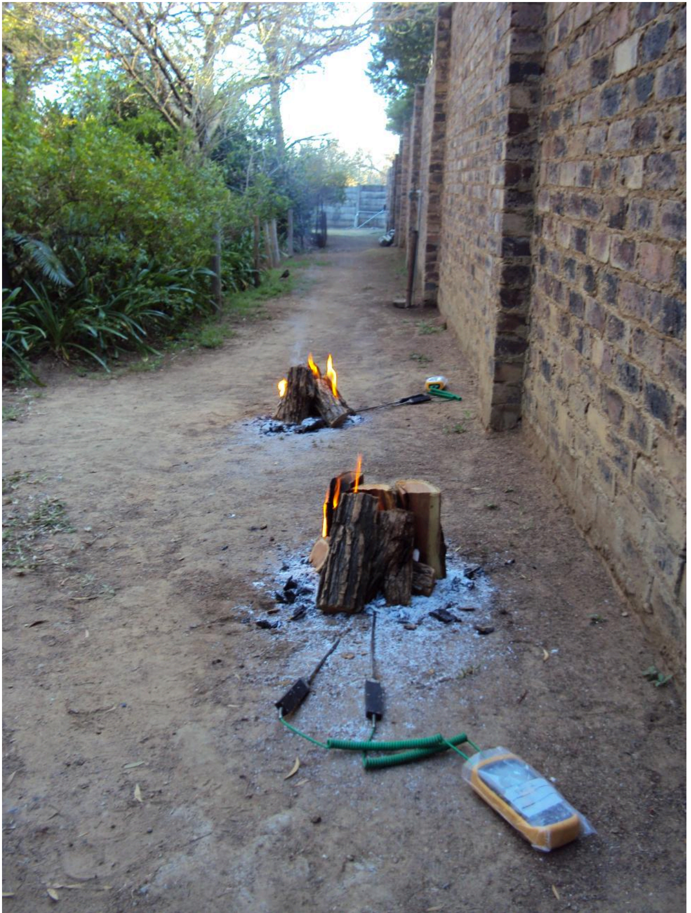
FIG 5. TEST EXPERIMENTAL SETUP