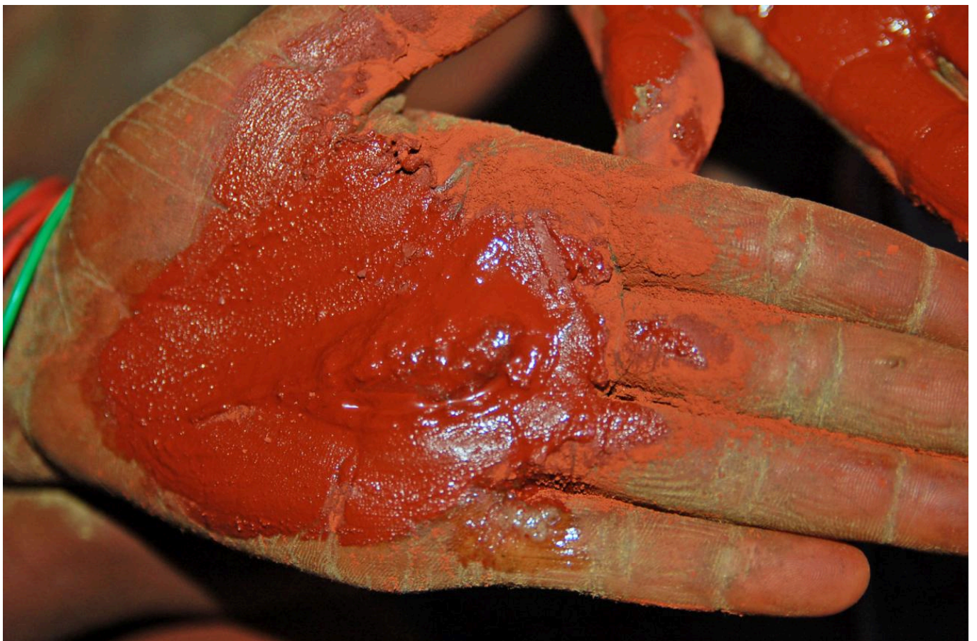
FIG 4. OVAHIMBAOTJISE.