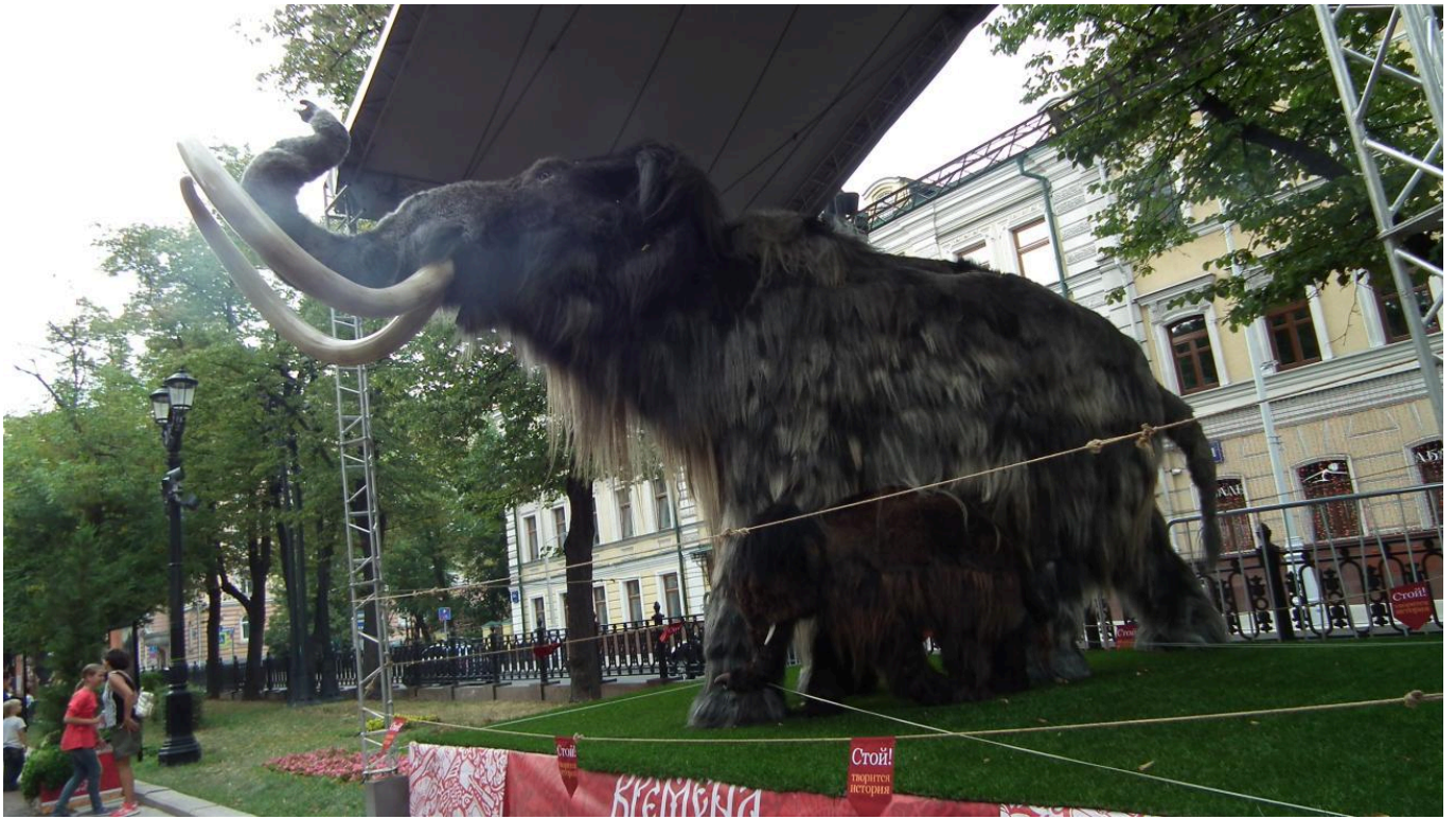
FIG 4. THE MAMMOTH AND HER CALF WAS A POPULAR EXHIBIT AND ONE WHERE PEOPLE ENJOYED POSING FOR PHOTOS.