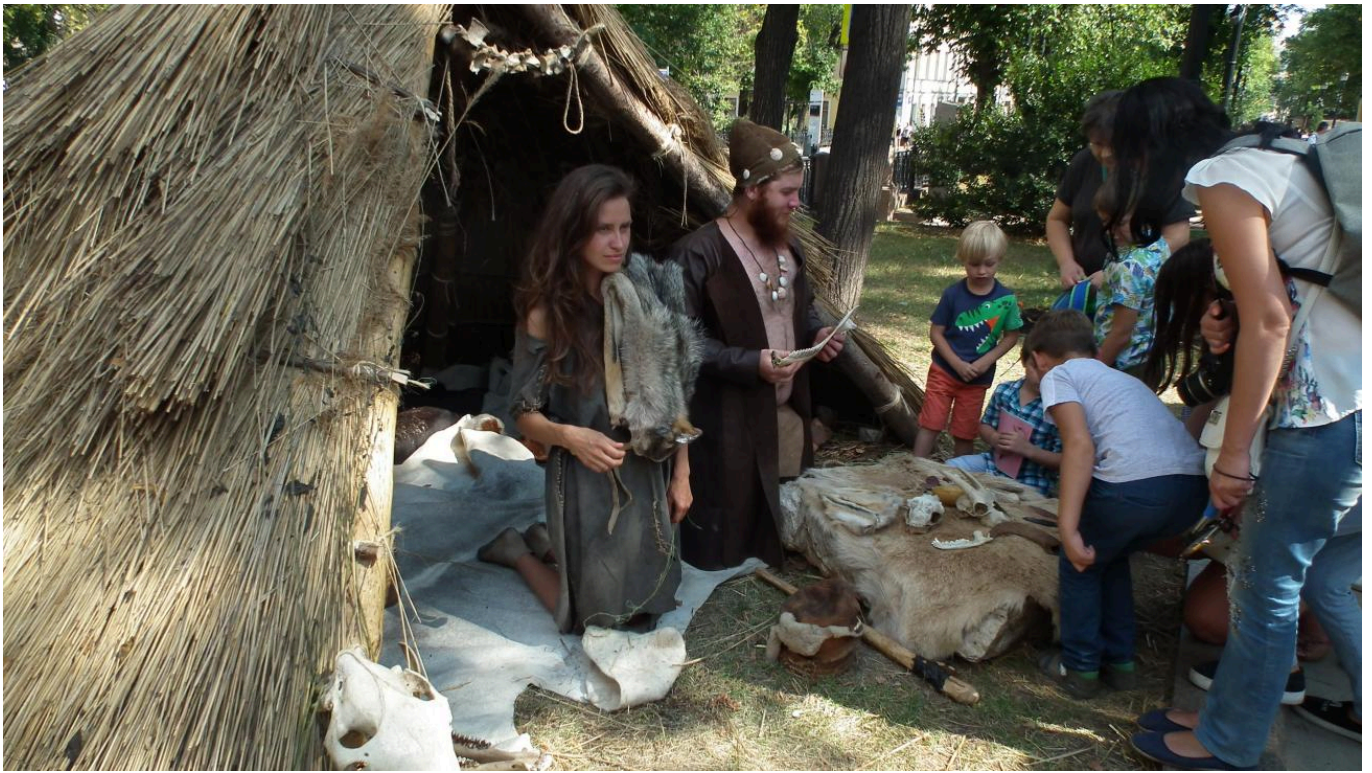
FIG 11. THE MESOLITHIC HOUSE AND A DISPLAY OF TOOLS THAT WOULD HAVE BEEN USED IN THAT PERIOD.