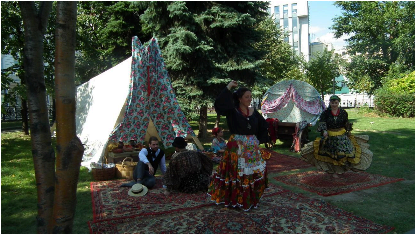
FIG 10. AN ENCAMPMENT OF ROMANY REENACTORS.