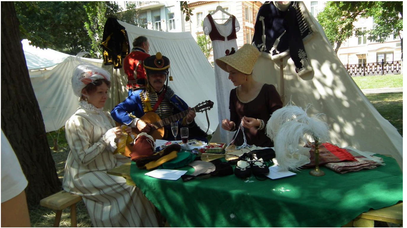
FIG 6. RELAXING WITH SOLDIERS AND FRIENDS FROM THE NAPOLEONIC WARS.