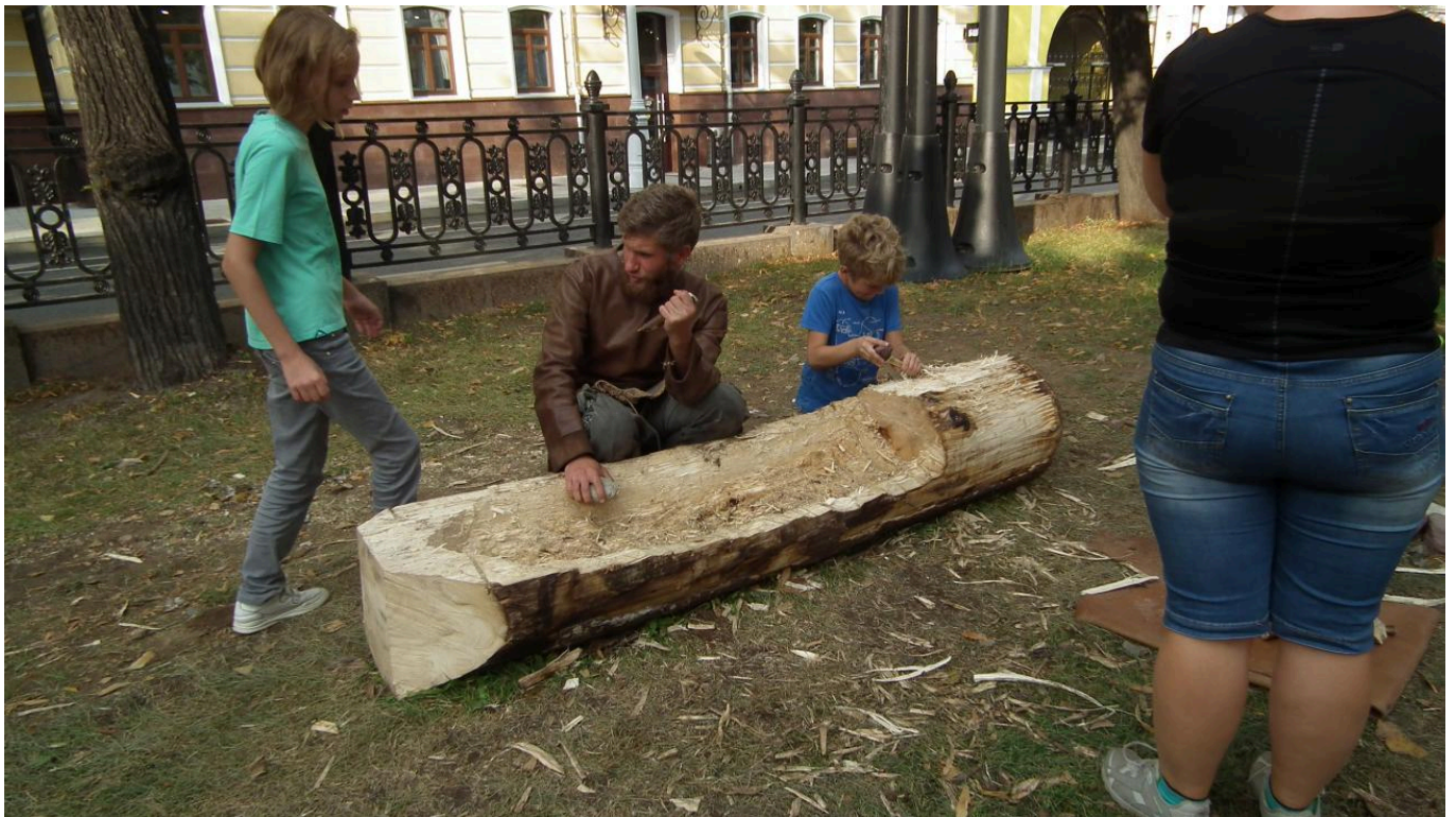
FIG 3. CARVING A LOG BOAT USING A STONE HAMMER AND ANTLER CHISELS.