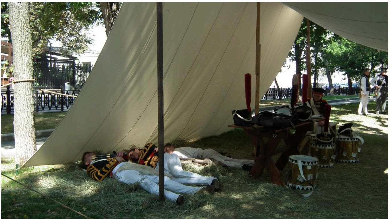
FIG 7. EVEN IN SLEEP, REENACTORS STAY IN CHARACTER!