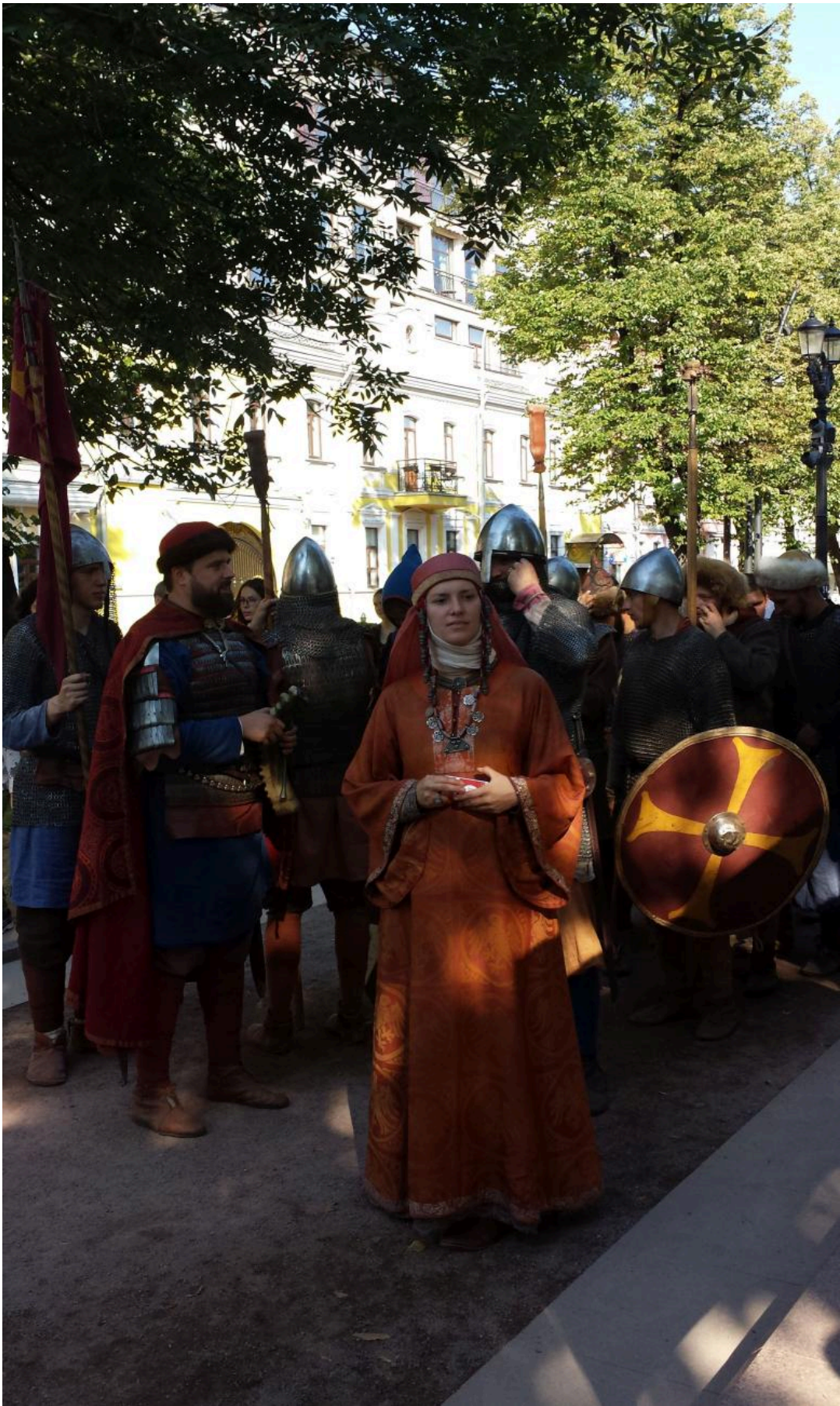
FIG 1. MEDIEVAL MUSCOVITES MADE A PROCESSION VISITING OTHER SITES.