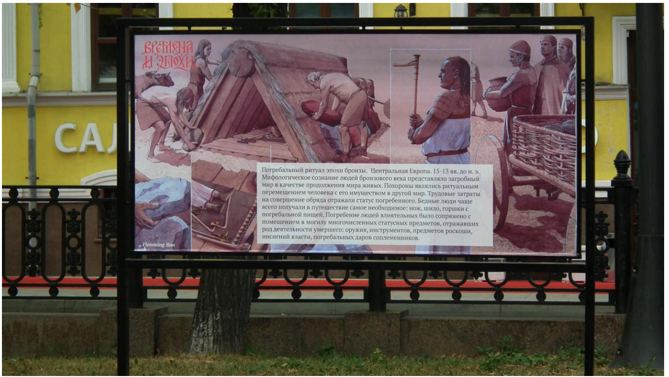
FIG 2. INFORMATION BOARDS DESCRIBE THE VARIOUS DISPLAYS AND REENACTMENTS.