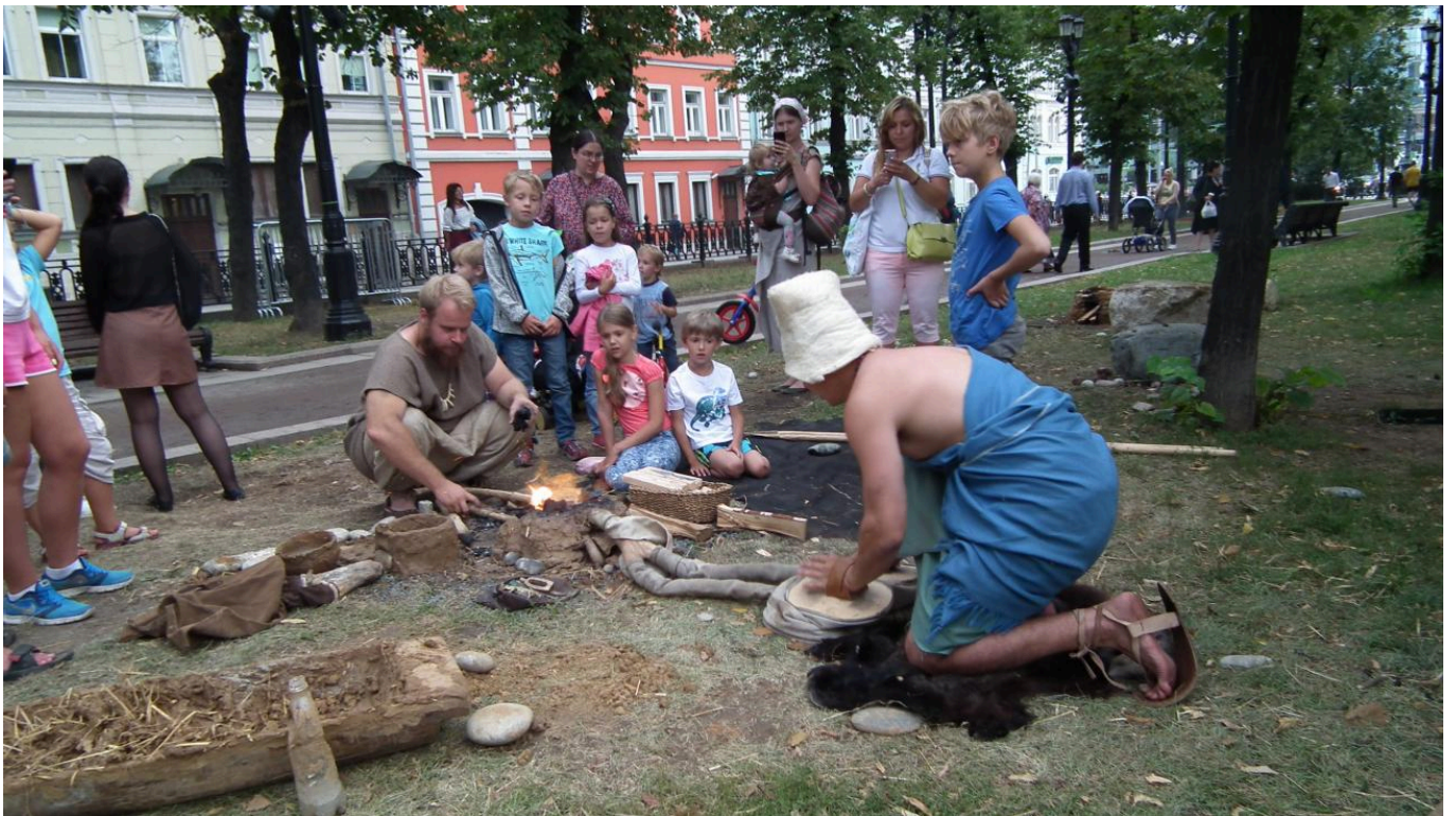
FIG 5. CASTING BRONZE WITH A VISITING PHOENICIAN.