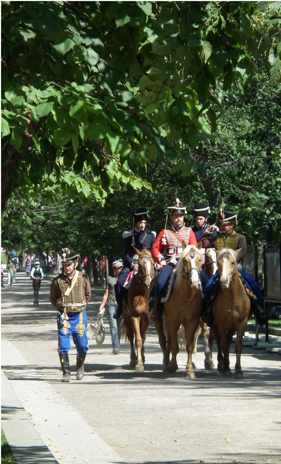
FIG 8. SOLDIERS EXERCISING THEIR HORSES DURING THE DAY.