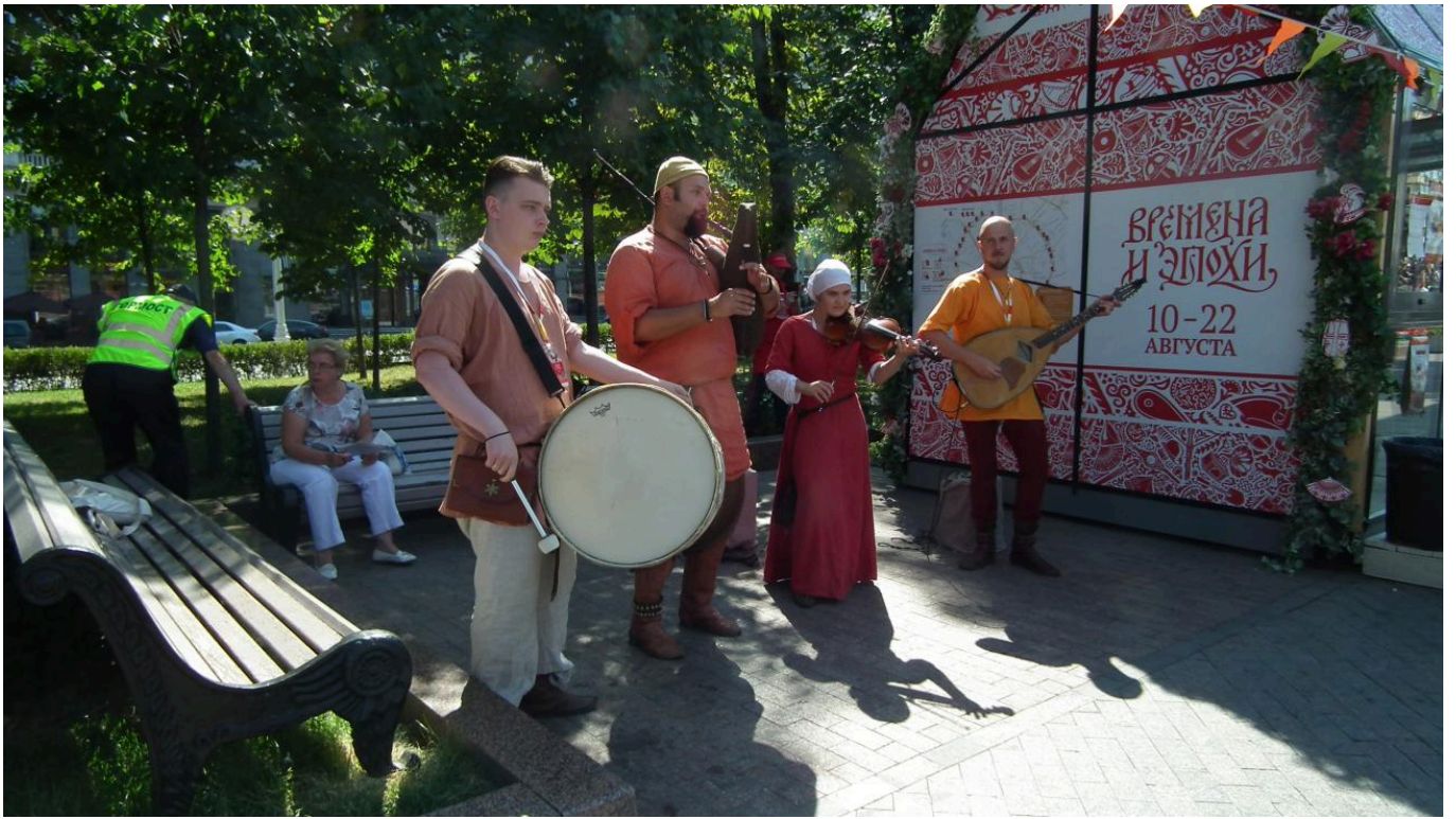
FIG 9. THE EVENT INCLUDED FOLK MUSIC WITH MUSICIANS IN TRADITIONAL COSTUMES.