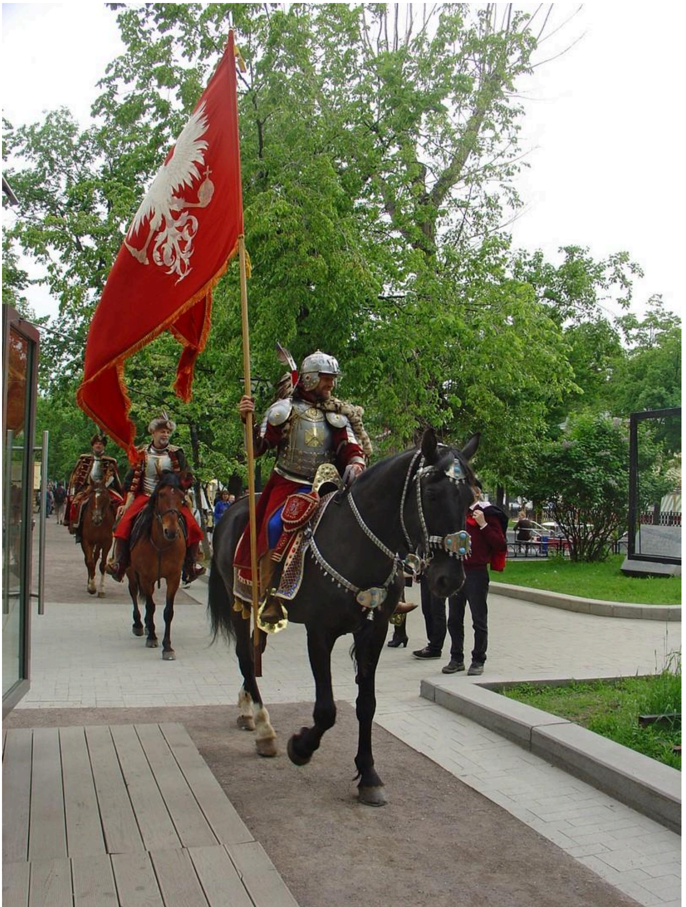
FIG 5. SOME OF THE PARTICIPANTS OF THE FESTIVAL.