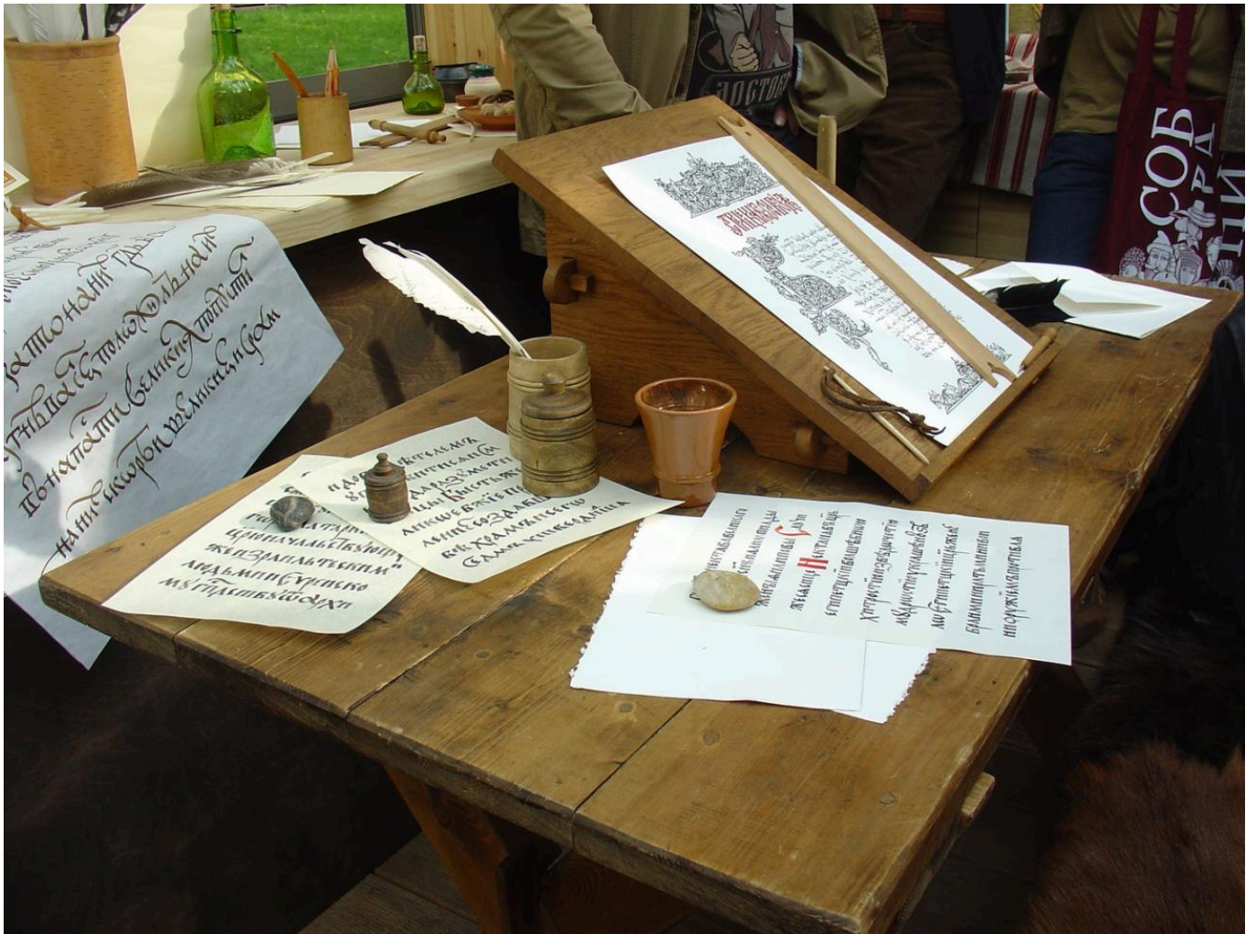
FIG 2. PRESENTING ONE OF THE PROJECTS DURING THE COMPETITION.