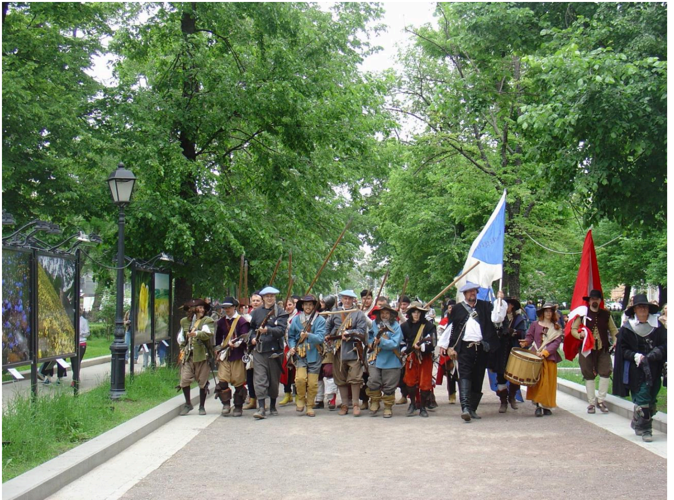
FIG 8. SOME OF THE PARTICIPANTS OF THE FESTIVAL.