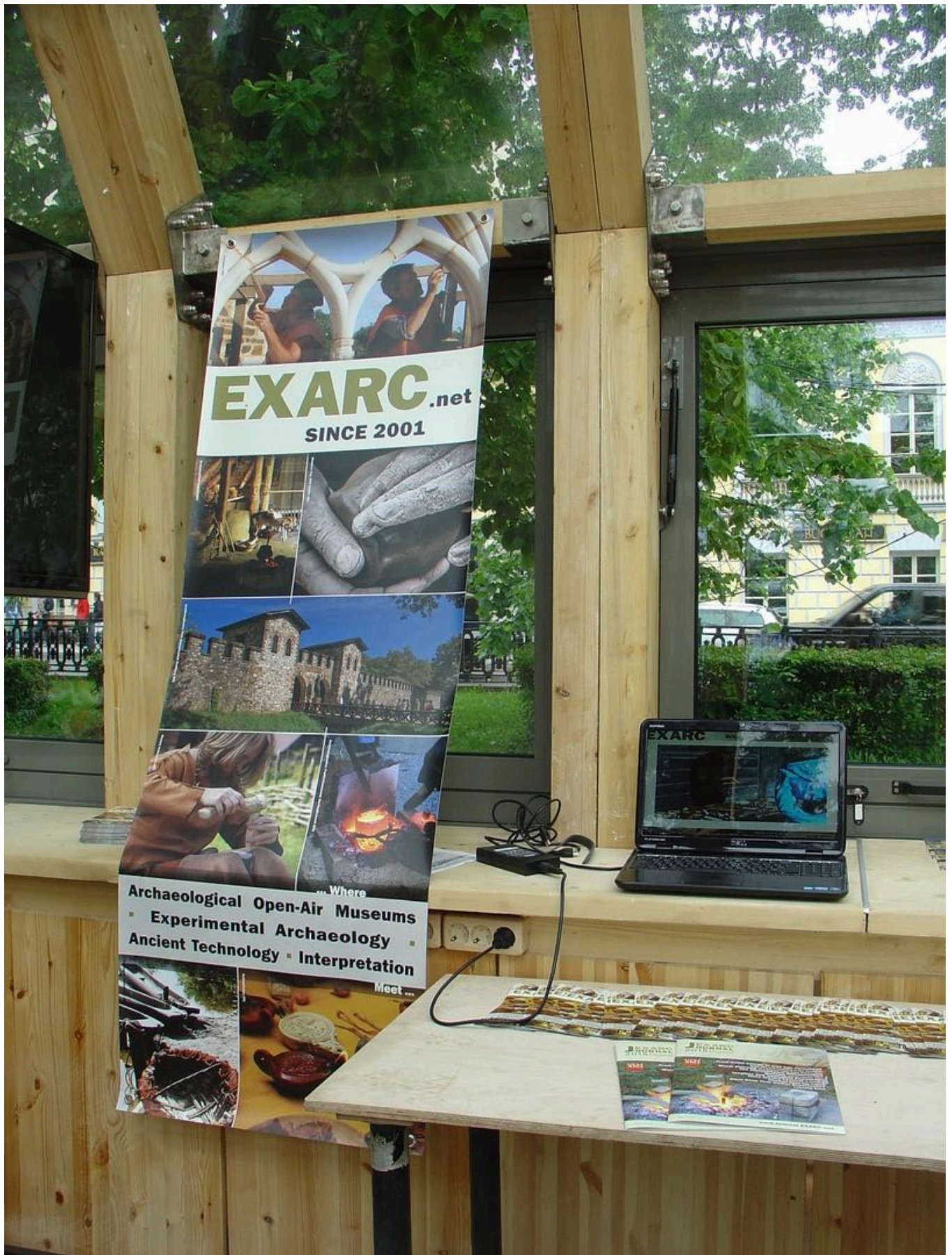
FIG 3. PRESENTING EXARC AT THE "TIMES AND EPOCHS" FESTIVAL.