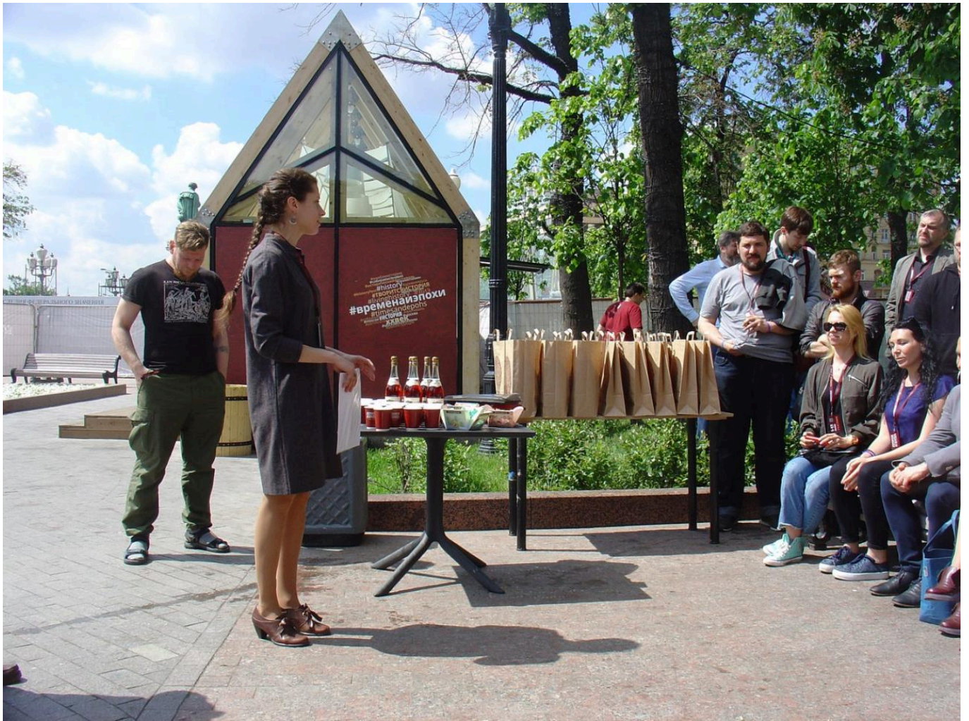
FIG 9. THE AWARDING CEREMONY, AWARDS GIVEN TO THOSE WHOSE PROJECTS HAVE BEEN CHOSEN AS THE BETS ONES.