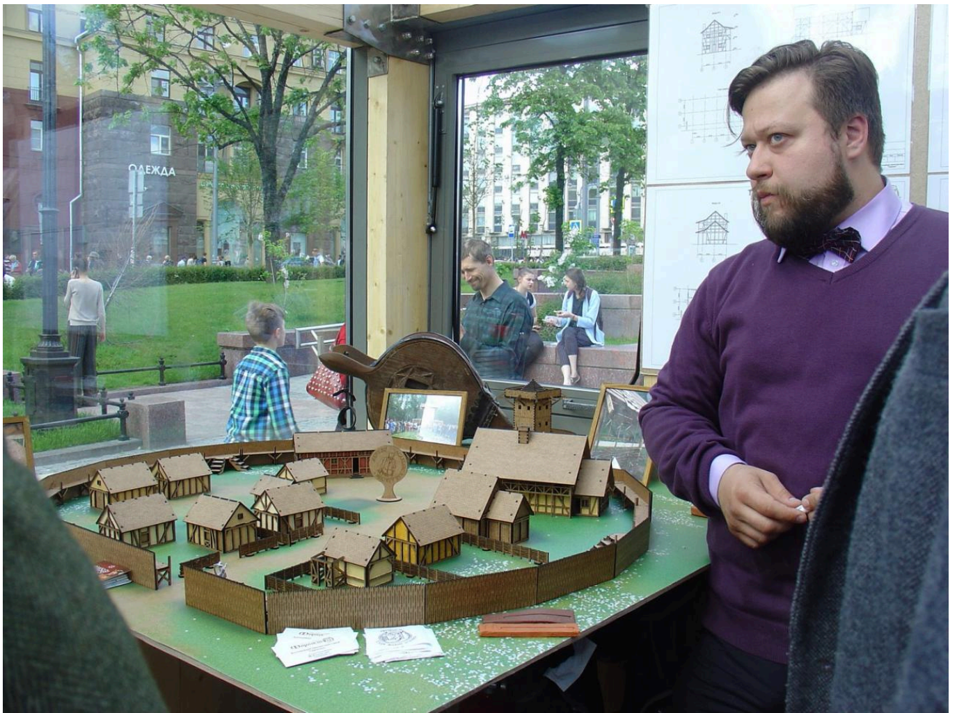
FIG 1. PRESENTING ONE OF THE PROJECTS DURING THE COMPETITION.