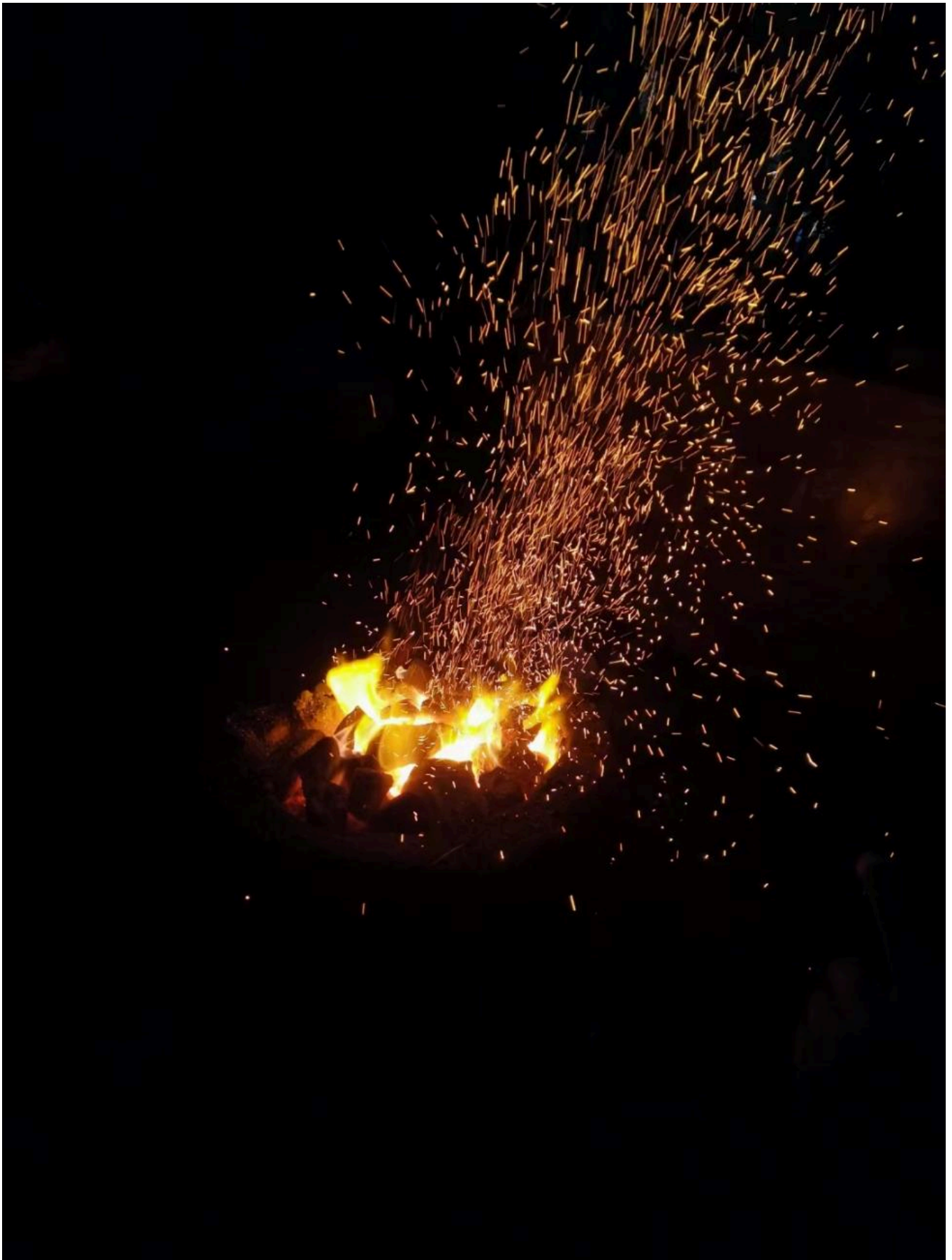
FIG 3. THE SPARKS ABOVE THE FURNACE WHEN CASTING BRONZE ARTIFACTS.