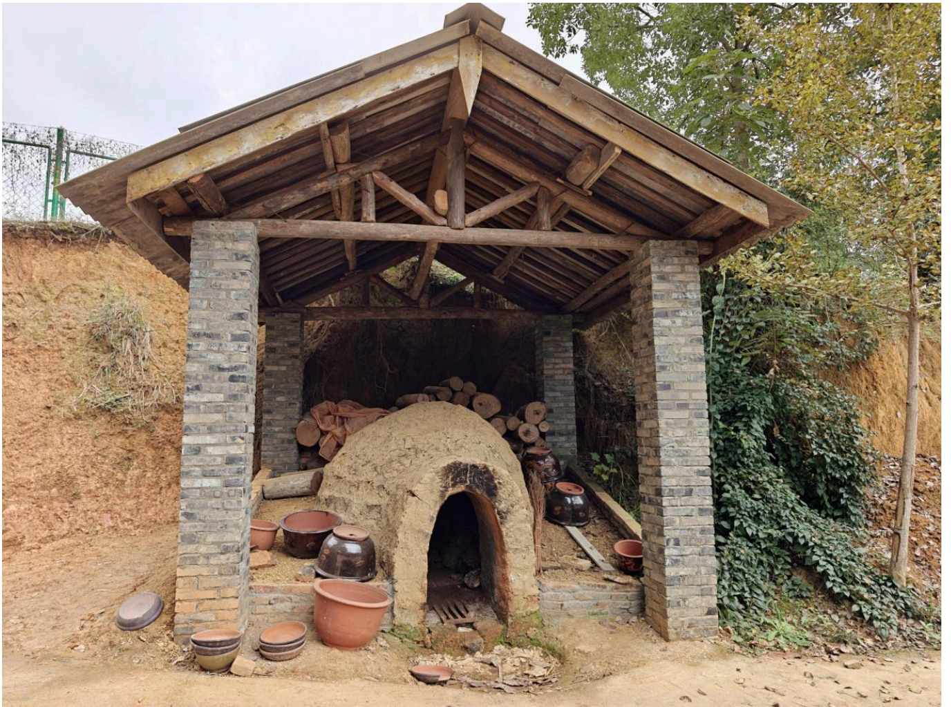
FIG 1. EXPERIMENTAL RECONSTRUCTION OF POTTERY KILNS FROM CHINA'S BRONZE AGE.