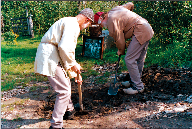
Fig. 5 Digging the experimental “black pit”. ■

The experiment was executed in the Netherlands, at the Historisch OpenluchtMuseum Eindhoven, September 3 – 5, 2004. To gain more experience, the activity was also performed as a demonstration in the archaeological museum of Biskupin, Poland, during their 10th archaeological festival, three weeks later. During the experiment, all activities were filmed and photographed. Day reports were kept as well.