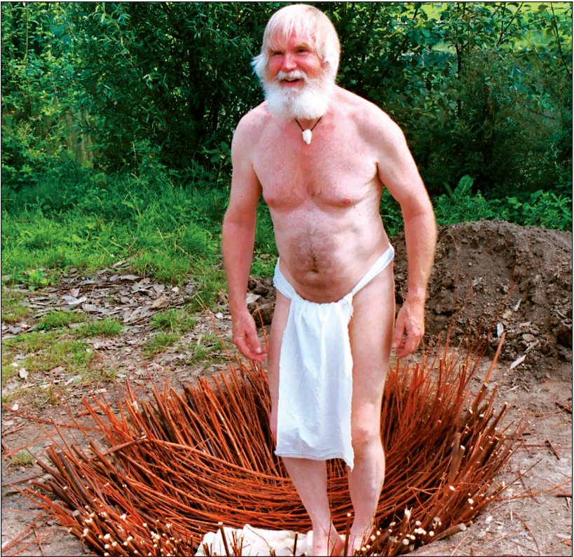
Fig. 4 Probably, most medieval fullers trampled the wool wearing only a loin cloth. ■