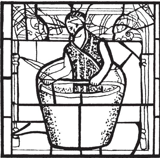
Fig. 6 Fulling. After a stained glass window in the cathedral of Semur-en-Auxois, 15th century. M. Pavon 1972, quoted in Sorber 1998. ■

The best way we could think of cleaning the cloth was using a washing machine with a cold wool wash programme. When ready, we could clearly see that one section had shrunk less in width as did the others and over all, it did turn very white again.