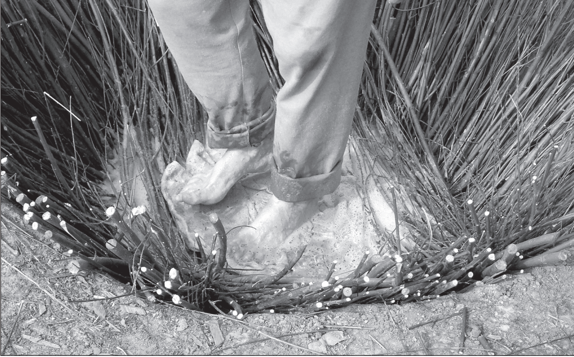
Fig. 1 Detail of the fulling process: the soapy mixture is rubbed into the cloth by trampling with bare feet. ■