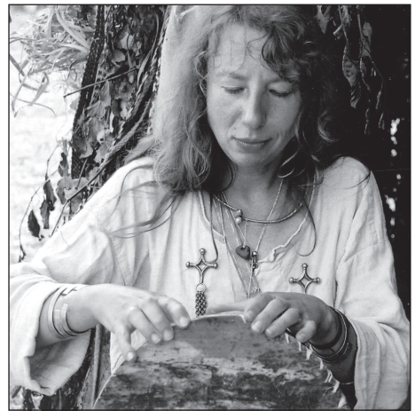
Fig. 4 Production of linden bark. ■

and hay to make it dryer. The smell of rotting grass, mixed with the smoke of a bonfire and boiling tar, created a really medieval atmosphere.”