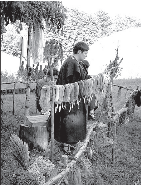
Fig. 7 Yarn and cloth dyeing with natural dyes. ■