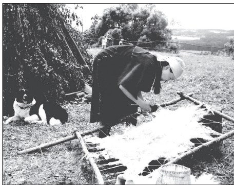
Fig. 5 Stone Age hunters camp: skin milling. ■

The Luchtanas family recreates ancient cooking. Depending on the period, not only the clothes and utensils but also the methods and spices change. They consider Jacqui Wood of the Celtic Village in Cornwall, England their teacher. She established an open-air museum of the early Iron Age and recreated Celtic cuisine.