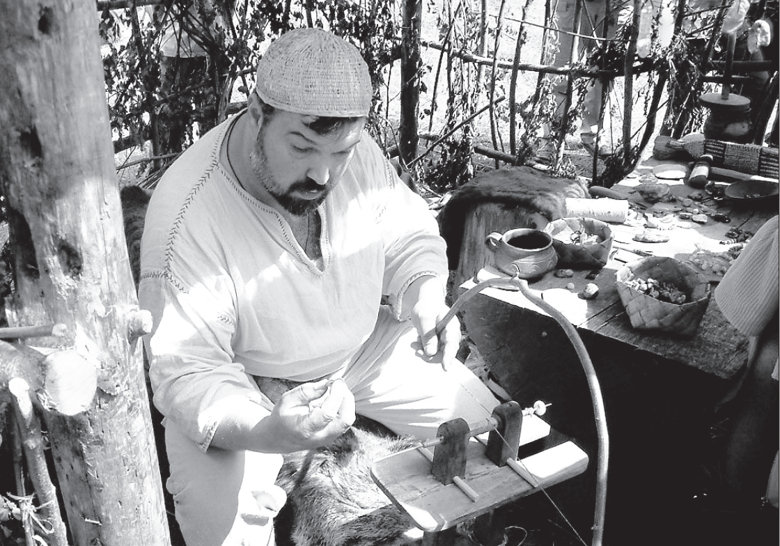
Fig. 1 Amber processing, Neolithic amulet production. ■