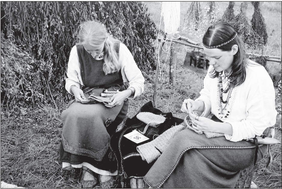
Fig. 2 Sewing with bone needle. ■

Every year the festival features new ideas and each year a growing number of guests from abroad are invited to participate. “ This year we had visitors from all of the neighbouring countries, ” says Vitkūnas. “ A festival like this is also a forum for cultural exchange. It’s interesting to compare the cultural links between our museum materials ”.