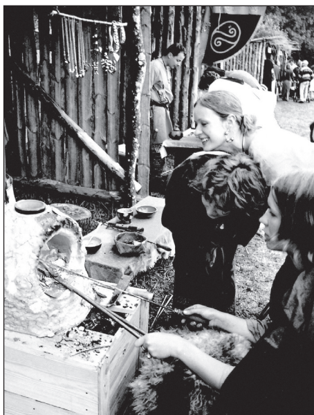
Fig. 6 Glass bead production in the kiln. ■

“Pajauta is the name of the valley, surrounding Kernavė, and it is also the name of our club. It is more than just a club; it is a feeling, without which a member of our club would be blind and deaf.” At present, the club has 42 members,