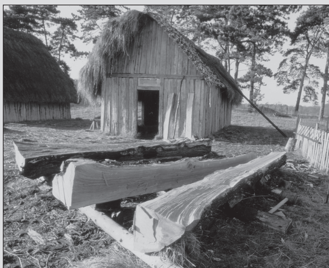
■ Techniques at working timber at West Stow Anglo Saxon Village were inspired by Coles' extensive research and experimental work (John Coles' archive).

I detect a great deal of experimental archaeology in modern archaeological studies, where we are forced to confront the problems of artifacts, structures and landscapes, their fragmentary nature, often their lack of organic components, and their loss of immediate context and environment. By at least considering the variety of options, we are in effect conducting an experiment or series of experiments in the mind."