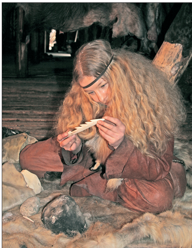
■ Fig. 2 One of the Kierikki guides inside a Stone Age house reconstruction holding a harpoon made of bone

An MA studies was executed into tourist destination marketing, using the liveARCH member Lofotr (NO) as a case study (see elsewhere in this volume) and another MA studies was executed into education, using Fotevikens Museum (SE) as case study (see elsewhere in this volume).