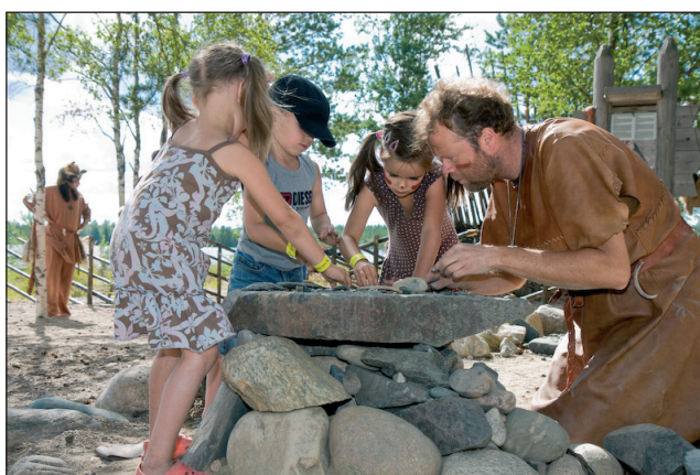
■ Fig. 4 Grinding stone objects is one the favourite activities at the Stone Age village