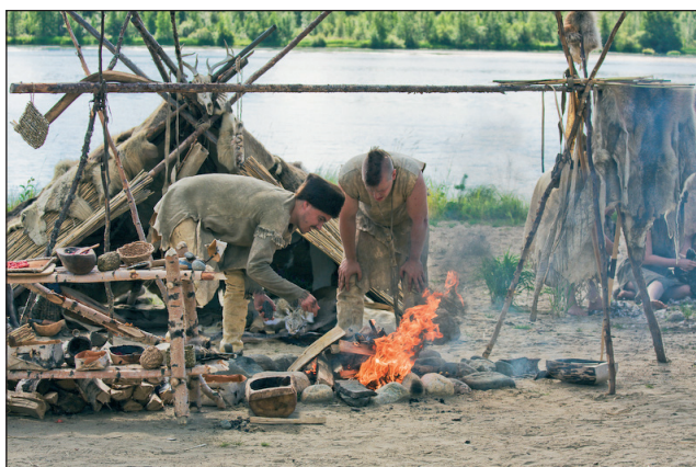
■ Fig. 3 Stone Age Market is the main event of the year in Kierikki. Two members of the hunter-gatherer tribe "Kuttelo" by the fire

With the municipality of Calafell in Catalonia as coordinator, a total of ten museums have joined forces in OpenArch, an overview you will see in Fig. 1. When evaluating liveARCH with a perspective on continuation, we learned to put more emphasis on science. Joint experiments will be defined and executed over a period of 5 years and in that way move experimental archaeology forward. All too often, experiments are not repeated or not repeatable and therefore lack the merit of progressing our knowledge, reinventing the wheel again. OpenArch will also focus more on education, an important reason for existence of many of our museums and centres. The museum management can benefit from this project and we intend as well to open a dialogue with other museums and museum organisations. Intangible heritage is an important asset of our sites which makes us different to others; defining this