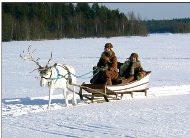
■ Fig. 5 Reindeer sledge ride at the river Iijoki, on the banks of which the Stone Age Village lies

better in the sense of the stories to be told, the knowledge to be shared in each local example is a key task. Finally OpenArch will work very much with dissemination and PR – not just towards our colleagues, but also promoting archaeological